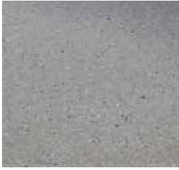
SB6LS Natural Gray Tabletop Polished Surface Sealed to two coats of Anti-Graffiti coating