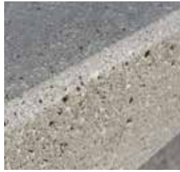
Light Sandblast Sides.