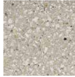
Base or Leg Finish SB7: Natural Gray Limestone Sandblast Finish

Leg or base finish is available in sandblast finishes only. Polished finish is not available.